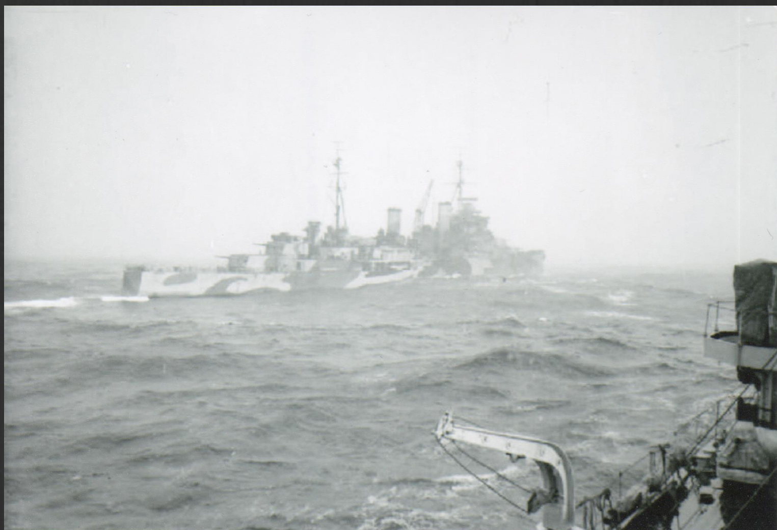
HMS Trinidad, as seen from HMS Fury in the North Atlantic

The weather was our undoing. When it finally abated we discovered that the convoy was scattered over 180 miles and we started the dreary process of rounding up our ships,